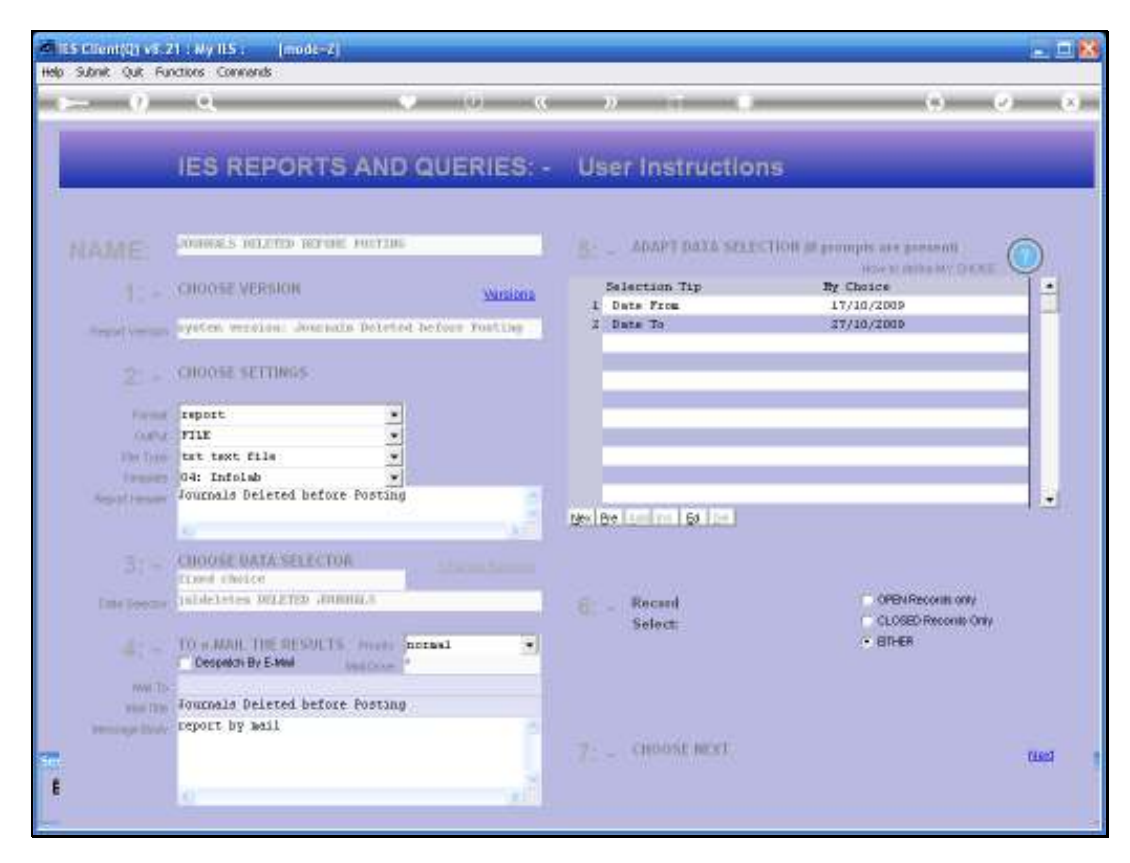
Slide 3 Slide notes: